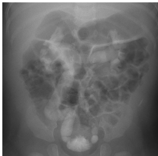
Fig. 2. Voiding cystourethrography findings show vesicoureteral reflux (right, grade V; left, grade IV).

A variety of factors contribute to the pathogenesis of hyponatremia and hyperkalemia in neonatal and infant periods. In these children is very important to establish or exclude CAH because this is a life-threatening condition [3]. More than 90% of CAH are caused by 21-hydroxylase deficiency (so-called classical salt wasting form). The clinical presentation of 21-hydroxylase deficiency in female results in masculinized external genitalia and vomiting within a few days/weeks after birth, severe renal wasting, and dehydration in both sexes. Our patient was an infant with poor weight gain and with normal external genitalia. He showed hyponatremia, hyperkalemia and elevated serum aldosterone level.