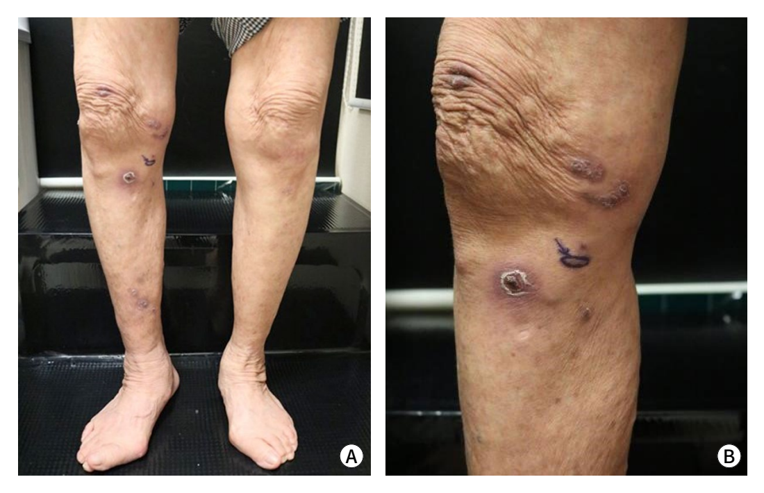
Fig. 1. Multiple erythematous to maroon-colored crusted deep nodules were arranged linearly on the right leg. Informed consent was obtained for the publication of this case report and accompanying images.

After 4 months on this regimen, the lesions completely cleared, and no relapse was noted