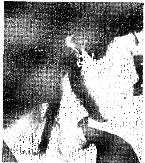
Fig. 2. This photograph shows atrophy of sternocleidomastoid muscle of the right side of this patient.