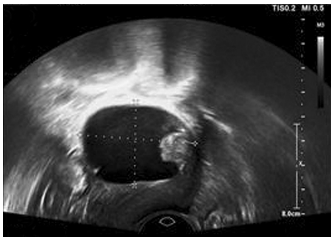
Fig. 1. Trans-vaginal ultrasonography showed 5-cm cystic mass in uterus with solid component.

sarcoma or endometrial stromal sarcoma. We performed a total laparoscopic hysterectomy and bilateral salpingo-oophorectomy. And then the uterus and both adnexae were extracted through the vaginal opening with intact state. We opened uterus and found tumor which had brownish cystic fluid and about 2 cm sized and colored in light yellowish, polypoid protruding solid mass. The mass was located only within the myometrial wall. Histopathological examination of frozen section revealed malignancy. So, staging operation including pelvic lymphadenectomy, paraaortic lymphadenectomy and appendectomy was performed additionally. During operation, there was no evidence of gross dissemination.