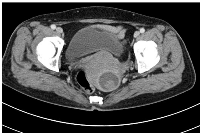
Fig. 2. Abdomen pelvic CT revealed a 4.4-cm cystic degenerative mass with enhancing solid portion consistent with myoma in the anterior portion of uterine body. The cystic degenerative mass was located in myometrium, maybe not involved endometrium.

Grossly, the uterus showed an irregularly-shaped, solid tumor mass ( 2 \times 1.5 \times 1.5 cm 3 ) surrounded by smooth membranous wall. When we opened the specimen, the endometrial canal was well preserved and covered by atrophic endometrial tissue. Several adenomyotic foci were observed in the myometrium and one of which was connected to the membranous wall. The tumor is confined within the myometrium, not involved endometrium (Fig. 3). A myomatous nodule (1×1 cm in cross) was noted in the lower uterine segment. Surgical margin was free and there were no parametrial, lymphovascular and lymph node metastasis.