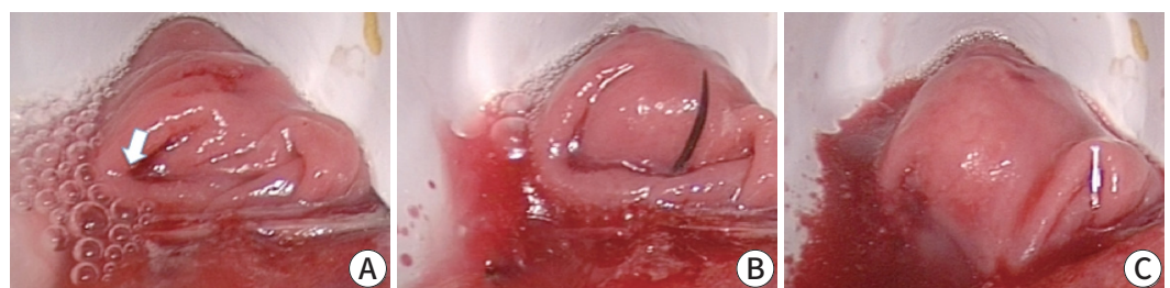
Fig. 2. Modified reverse air-leak test. (A) An air bubble is assessed within the rectum using circular anal dilator after filling the rectum with water. (B) A reinforcing suture is applied. (C) The absence of an air-leak is confirmed. Adapted from Crafa et al. [35] with CC-BY.

Intraoperative endoscopy has been used to evaluate the integrity of anastomoses, enabling the identification of bleeding at the anastomotic level or disruption of the anastomosis during surgery [36]. Endoscopy may also manage anastomotic bleeding, as it can be employed in a postoperative setting [37]. A systematic review and meta-analysis of six studies revealed that intraoperative endoscopy was linked with a decrease in postoperative AL (from 6.9% to 3.5%; OR=0.37; 95% CI, 0.21–0.68; P=0.001 ) and anastomotic bleeding (from 5.8% to 2.4%; OR=0.35; 95% CI, 0.15–0.82; P=0.02 ) in left-sided colon resection [36]. However, the air leak test using