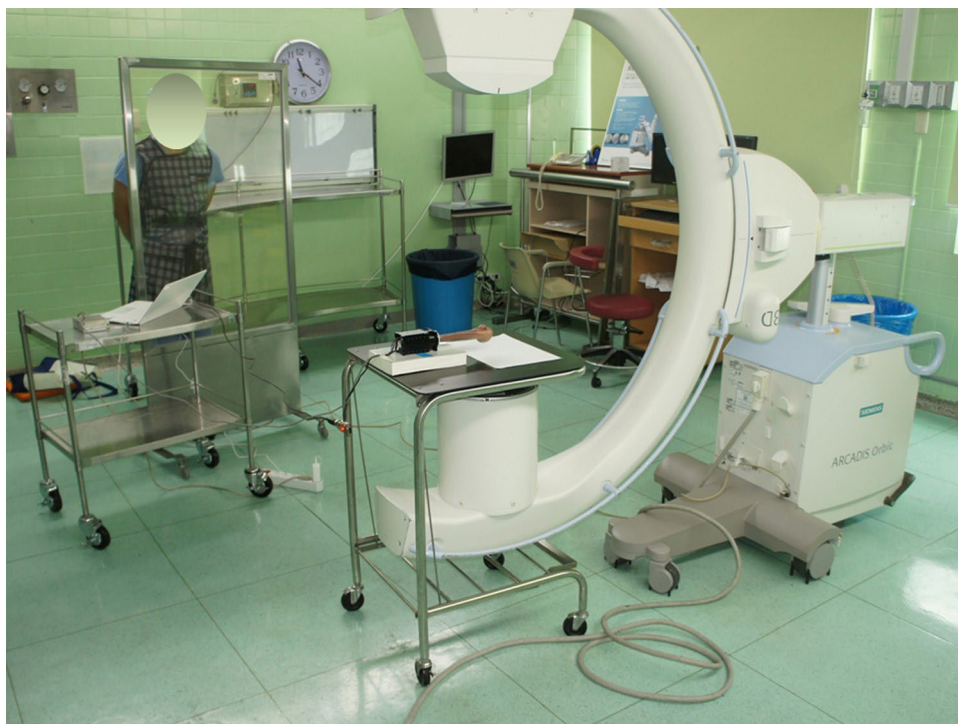
Fig. 1. Experimental setting. The motor–humerus complex was positioned on a radiolucent table under a C-arm. Using the rotation device, the proximal part was rotated, while the cut distal part was fixed. A fluoroscopic image was taken at each consecutive rotational position.